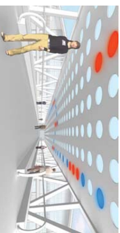
Connections by Electroland