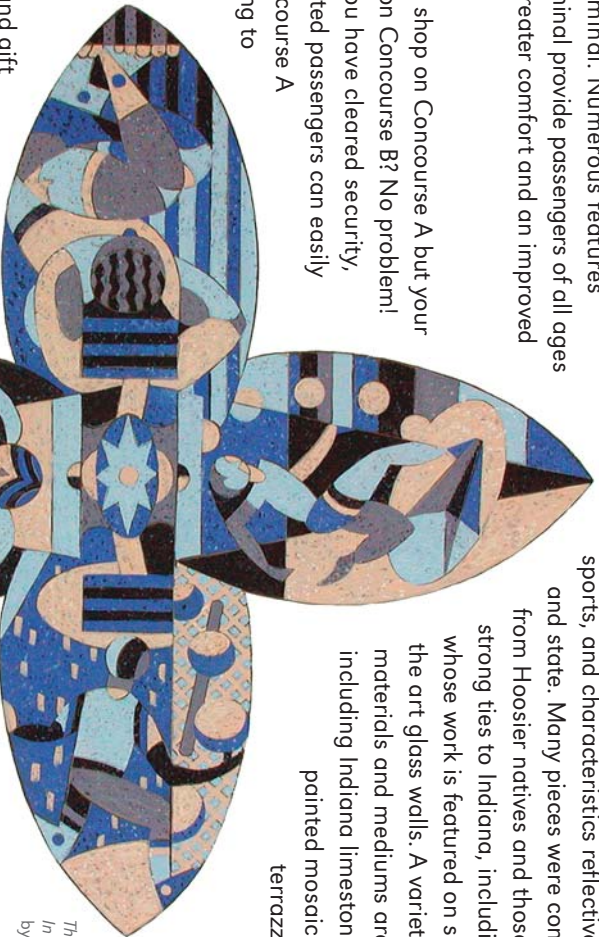
The Glory of Sports In Indianapolis by Tom Torlueme

Maximum accessibility, mobility, safety, and convenience for all passengers has been integrated throughout the terminal. Numerous features throughout the terminal provide passengers of all ages and abilities with greater comfort and an improved airport experience.